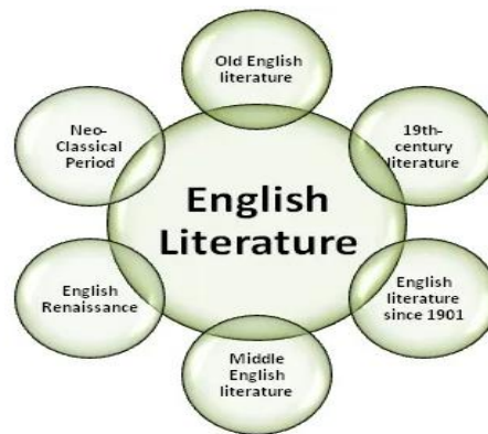
Figure 1 English Literature's prevalence in different eras

English Literature's prevalence in different eras depict the continuation of English Literature over certain centuries depending on multiple clusters of tones and styles of language (Lestari & Wahyudin, 2020). Old English Literature has some different word formations in usage for example, 'has' and 'you' used to be written as 'hath' and 'thou' repeatedly and contemporary readers used to get the original notion. As stated by Xiamen and Razali (2021) during the Renaissance period in England literature flourishes due to the dominance of Shakespeare, Marlowe, and Kid, Webster and so on in their eminent works of poems, drama and short stories.