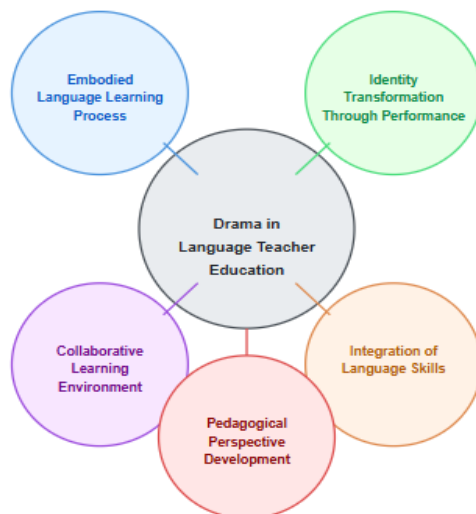
Figure 2. Conceptual model of the five major phenomena identified through qualitative analysis